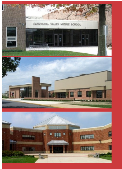
schuylkill valley SCHOOL DISTRICT