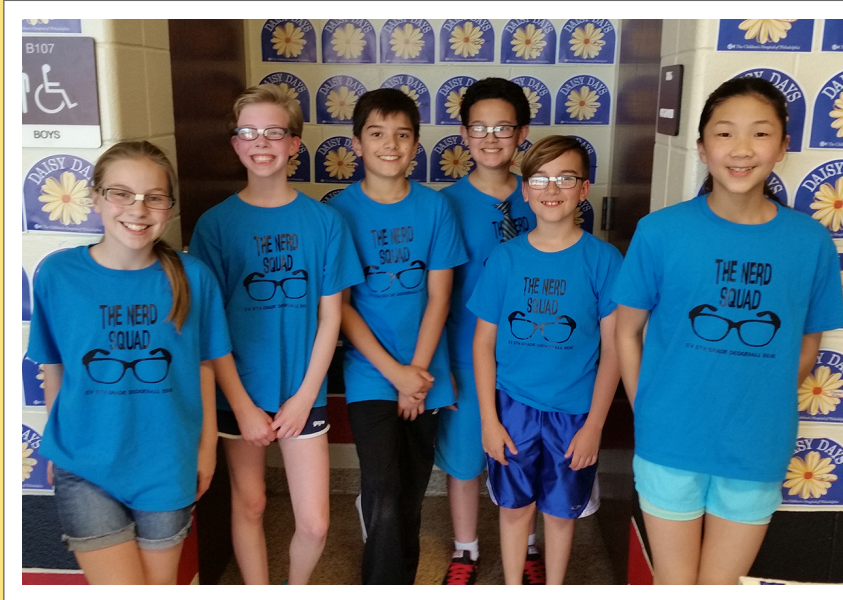
One of the fifth grade teams, The Nerd Squad, had a blast participating in the middle school's fundraising dodge ball tournament for CHOP.

This spring, Schuylkill Valley Middle School students raised $3,436.78 to help children in the Cancer Center at Children's Hospital of Pennsylvania (CHOP). The school held a fundraising dodge ball tournament involving 200 students from fifth through eighth grade. Students were encouraged to create T-shirts and team names for the competition. They also raised money by buying Daisy Days paper daisies to decorate the school lobby and hallways. Teachers participated in a Jeans Day for CHOP and donated snacks and baked goods to sell at the tournament. SV alumni generously donated funds to pay for pizza and drinks for the tournament. We are proud of our students, who worked together with the staff and community to give hope to children with cancer.