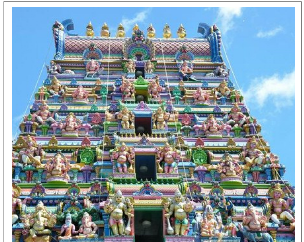
Tempio hindu, a small yet impressive place of worship. Built in 1992 the carved, brightly painted gopuram features lavishly decorated interiors and elaborate sculptures.

researching, and working together with teachers, friends, parents, and gifted classmates paid off. The competition was intense, but out of the 36 teams that participated, SV tied for fifth place by using nine clues to identify the landmark as the Tempio Hindu in Victoria on Mahe Island, Seychelles.