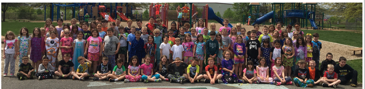
SVES students joined together to help kids with cancer on P’Jammin Day.