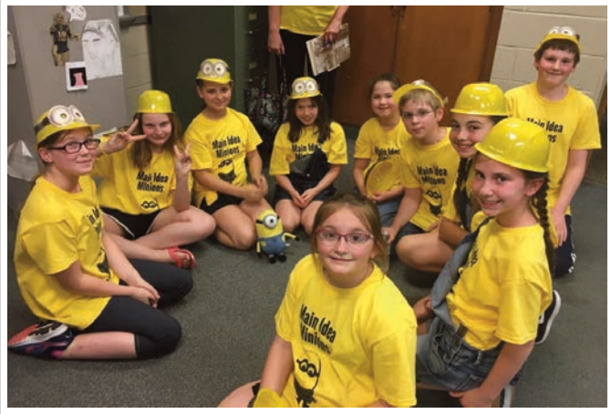
The Main Idea Minions competed in the Reading Olympics in May.